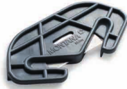
TWO SIDED CUTTING KNIFE Cuts the edges free